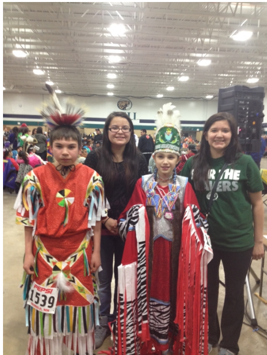
Bemidji State University 41st Annual Pow Wow