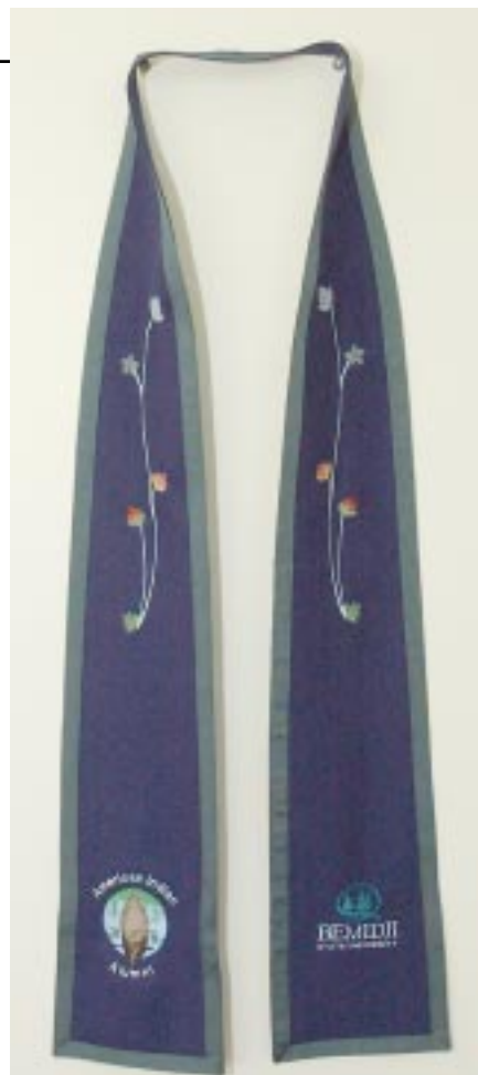
Pictured above is a graduation stole. These are given to graduating American Indian students each spring by the American Indian Alumni Chapter. Stoles will be for sale during the American Indian alumni reunion on Thursday, Oct. 2 for $50 each. They are available to all BSU American Indian alumni.

Items must be received no later than Tuesday, September 30, 2003.