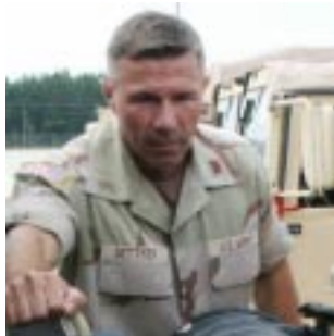
Citizen Soldier, page 3