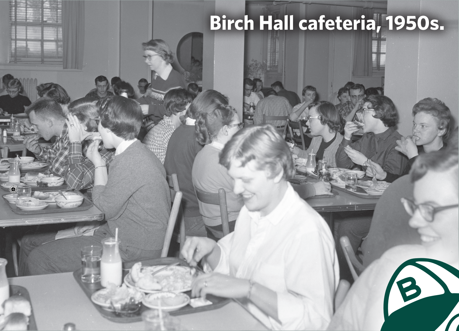
Birch Hall cafeteria, 1950s.

A 20-year wave of campus construction, remarkable in hindsight, began in 1950 with completion of a new home for the Laboratory School, which became Bensen Hall in 2012. Birch Hall, first of seven new dormitories built by 1969, was completed in 1952, followed by Linden Hall in 1959. The first phase of a new physical education complex, also completed in '59, included a gymnasium, swimming pool and fieldhouse with seating for 2,300.