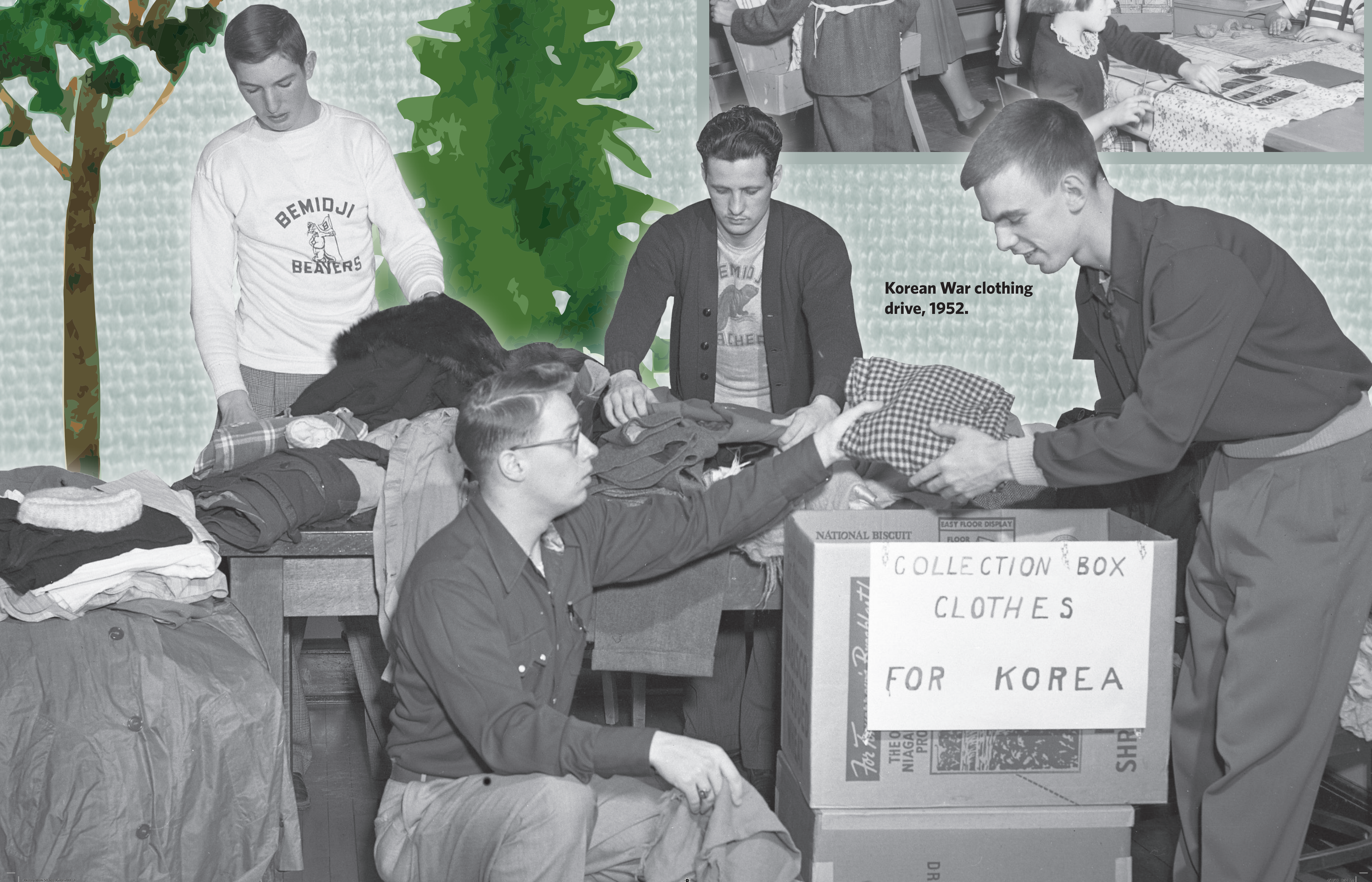
Korean War clothing drive, 1952.