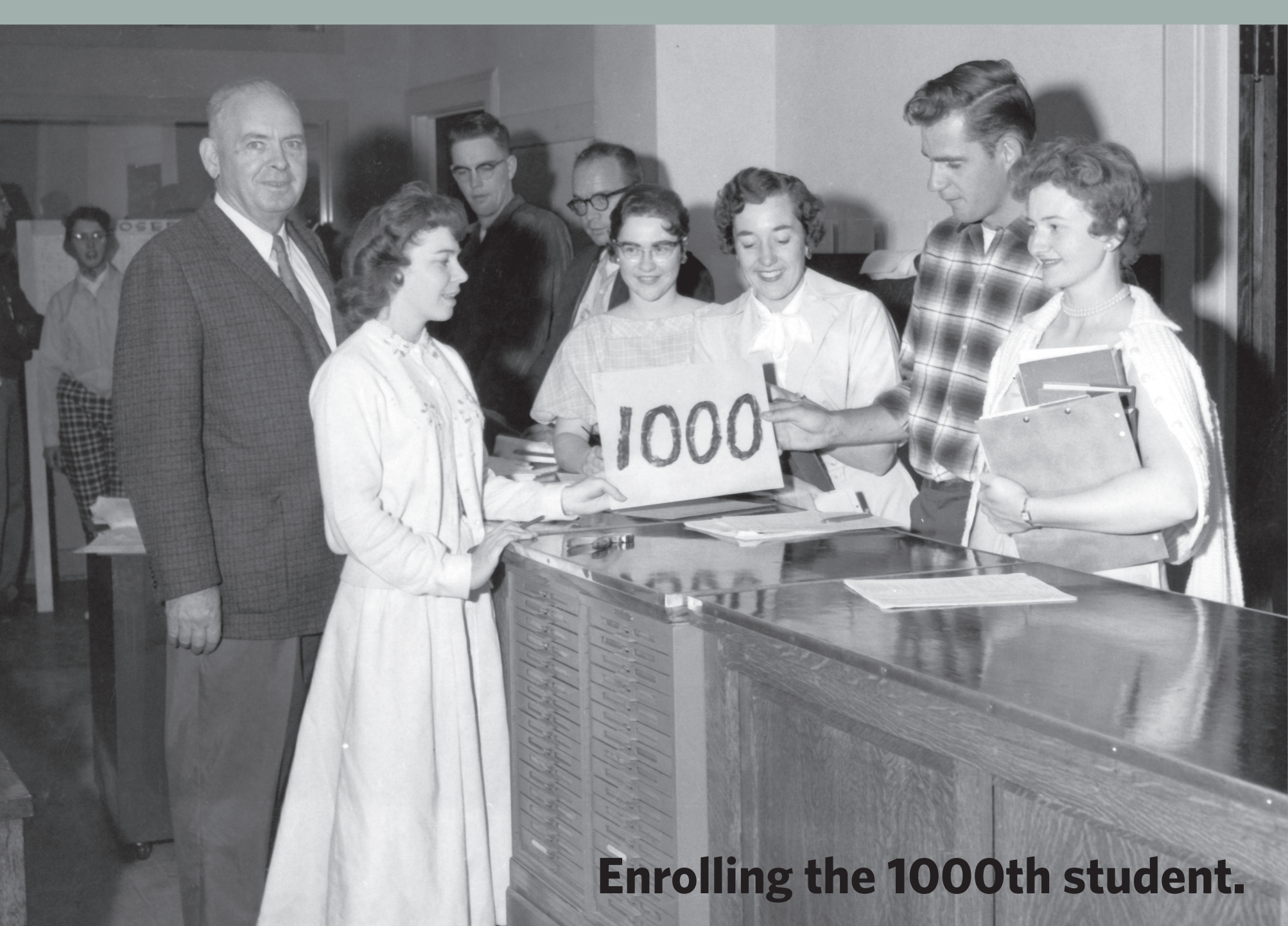
Enrolling the 1000th student.

After only incremental curriculum change during the first two decades at Bemidji State Teachers College, a Bachelor of Arts degree was added in 1946, though it had few takers. Not until 1950 did BSTC offer a specialized B.S. in business education and a major in American humanities — and a drama workshop was created in 1952. A Master of Science in education was begun in 1953, and in 1969, the college awarded 55 master's degrees.