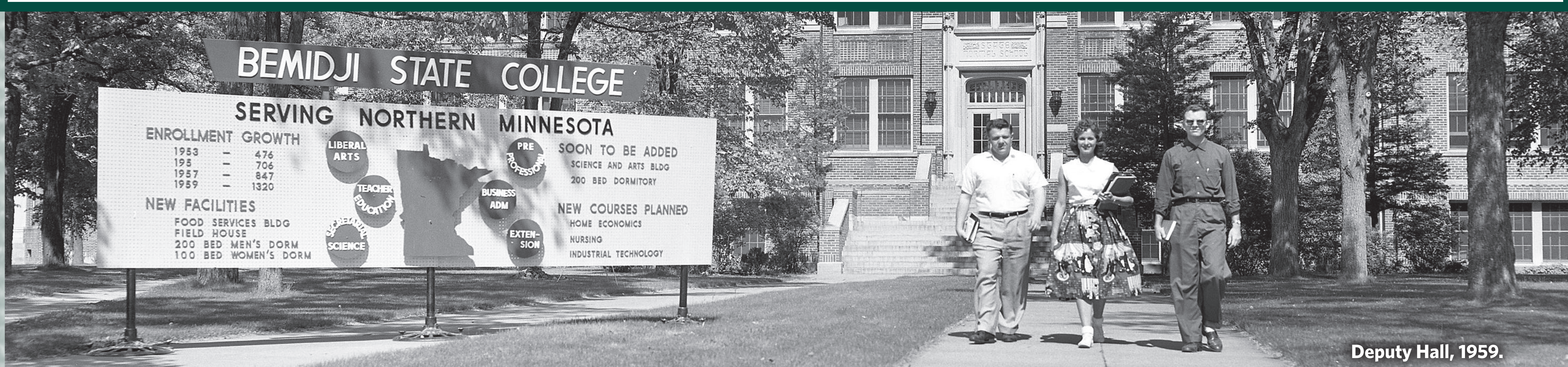
Deputy Hall, 1959.