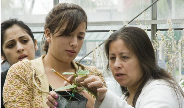
California State University, Los Angeles

45% of FY students at least occasionally spent time with faculty members on activities other than coursework.