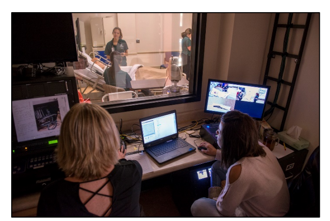
Faculty running a simulation

Faculty and student have worked hard to expand their learning through our skills lab and use of high definition simulation. We have added a communication manikin called Alex. He talks and responds to questions! We also have successfully obtained our new simulation mom and simulation newborn baby, enabling us to run a complete birthing simulation. Other new lab equipment includes a crash cart, a personal protection equipment cart, and a geriatric manikin. We are also using online simulation programs such as Shadow Health and Centennial City to expand our RN-BS learning experiences.