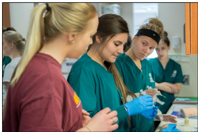
Introduction to Clinical Practice