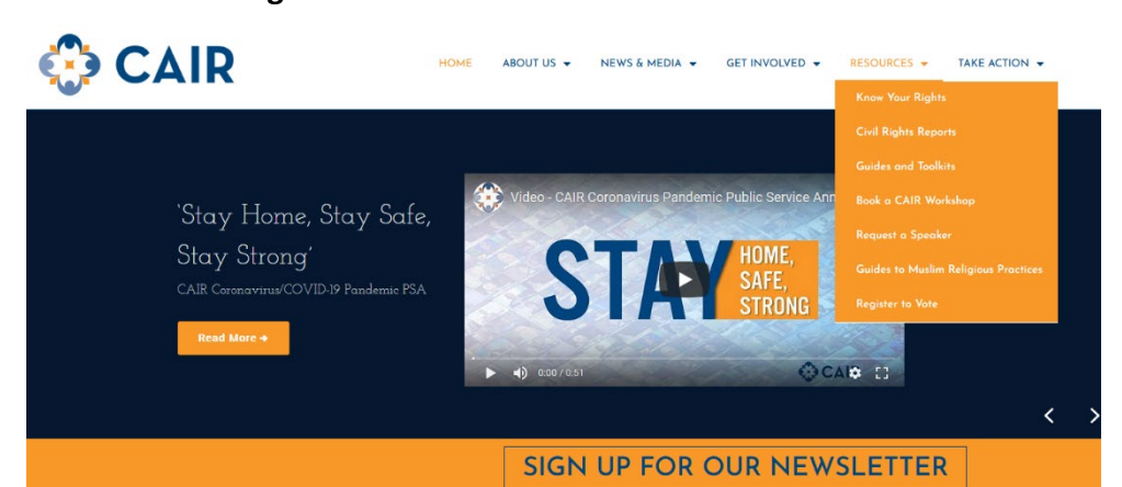
Figure 2: CAIR Voter Mobilization Website

American-Islamic Relations show one of the most direct examples I have been able to find of working towards registering voters with a