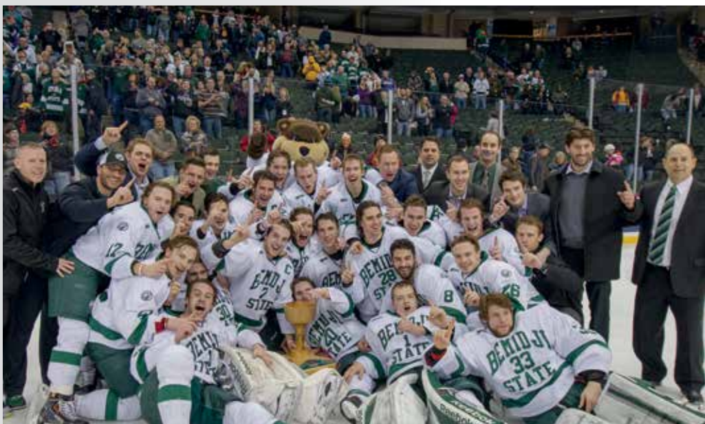
The BSU men's hockey team celebrates its Jan. 24 victory over Minnesota State University, Mankato in St. Paul's Xcel Energy Center to claim the North Star College Cup.