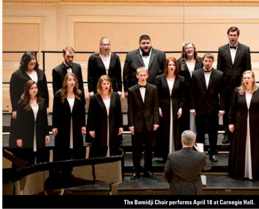
The Bemidji Choir performs April 18 at Carnegie Hall.