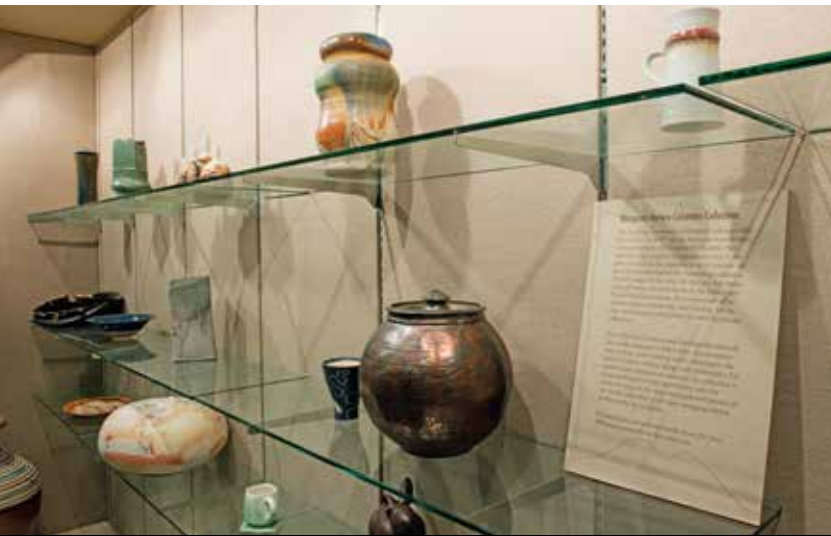
The Margaret H. Harlow Ceramics Collection, seen here at Bemidji State, will be among works exhibited in the BSU Gallery in Bemidji's new Watermark Art Center.