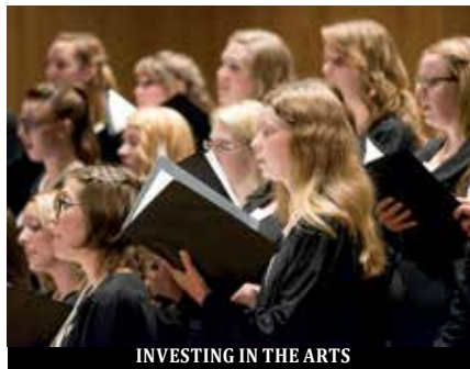
INVESTING IN THE ARTS