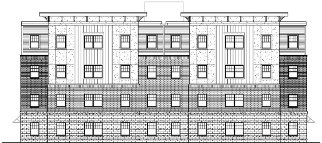
This architectural sketch is a view of the east facade, toward Bemidji Avenue, of a University Heights student apartment building planned for construction in 2016.