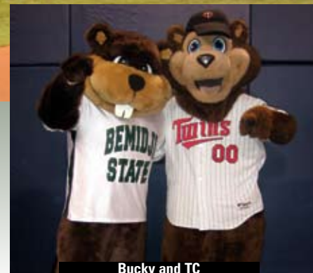
Bucky and TC