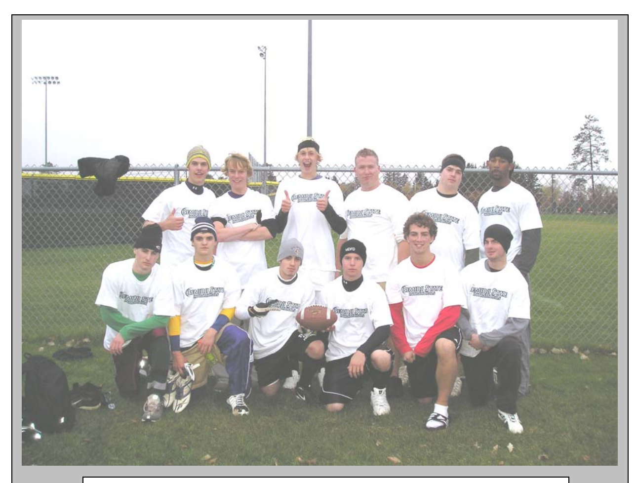
2007 Men's Competitive Flag Football Champions "No Namers"