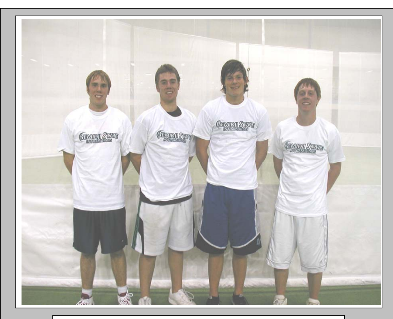
Men's Recreational 2007 3 on 3 Basketball Champs "Cyclones"