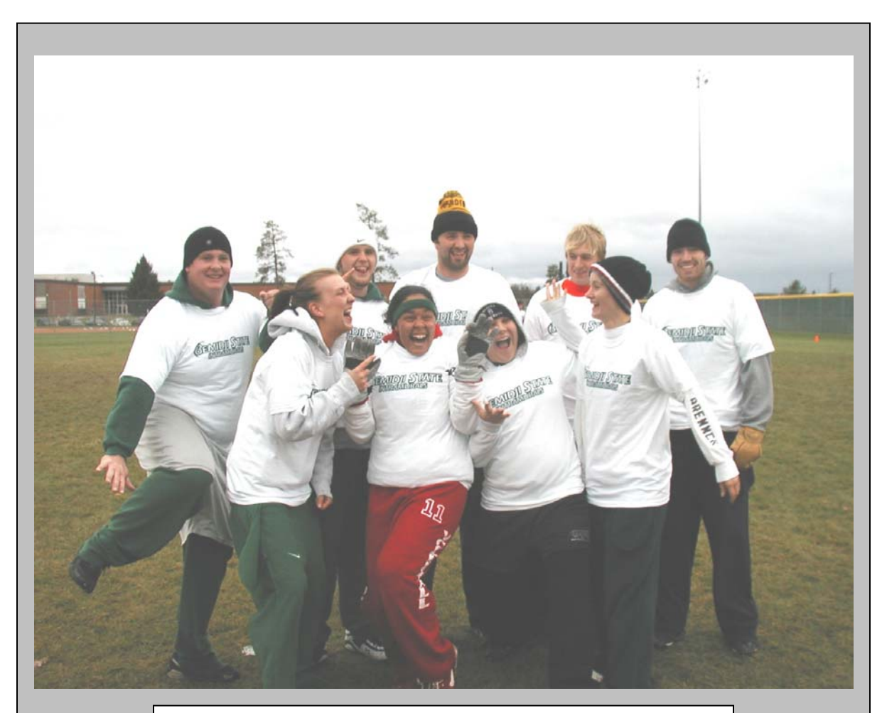
2007 Co-Rec. Flag Football Champions "Fighting Camels"