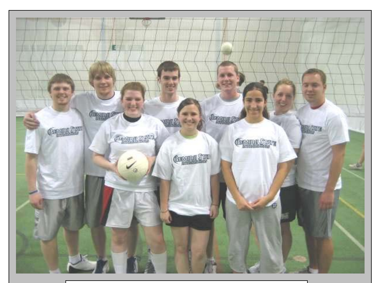
2007 Co-Rec Volleyball Champions "More Than Meets the Eye"