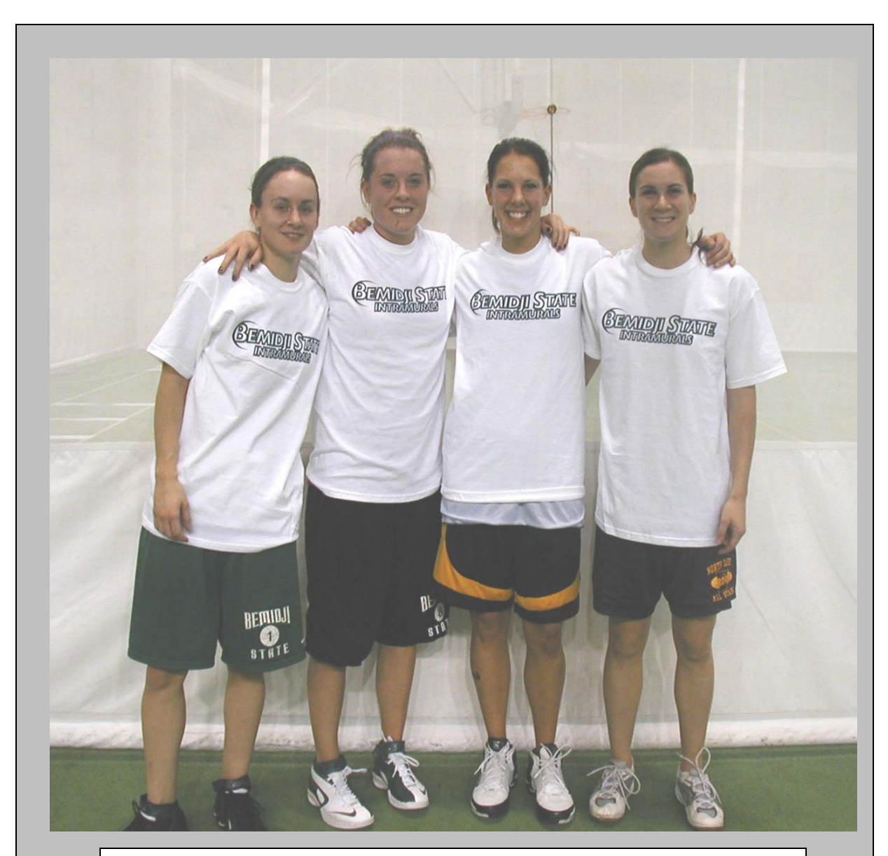
Women's 3 on 3 Basketball Champions "Dominators"