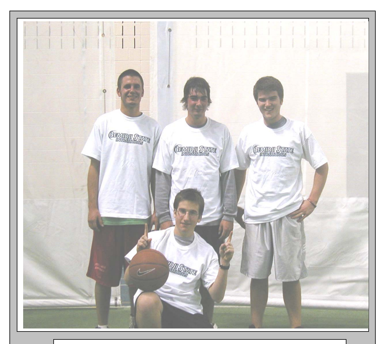
Men's 2007 Competitive 3 on 3 Basketball Champs "Team Dale"