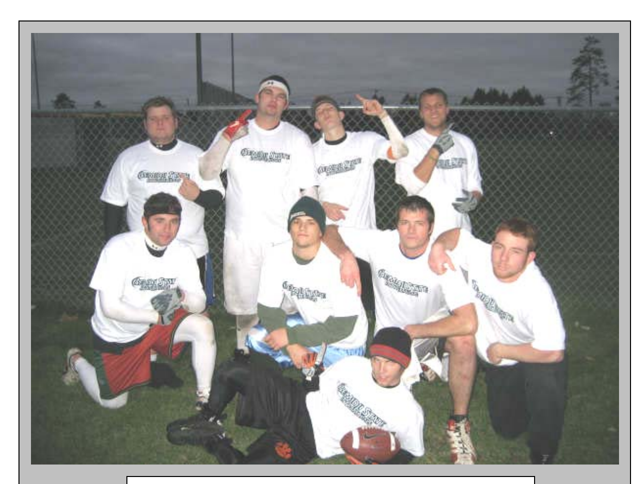
2007 Men's Rec. Flag Football Champions "28 Yards Later"